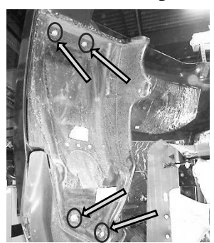
Figure 1 – Driver Side, open hood