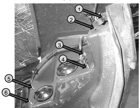
Figure 4 Headlight/Signal Nuts