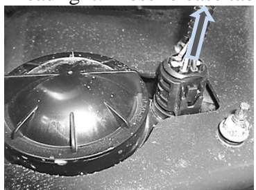
Figure 2 - Headlight wire

ii. Signal Light: Pull white locking-clip up to unlock (see FIGURE 3), then press release tab inward and pull plug straight up.