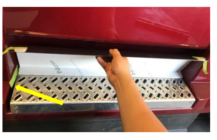
Figure 3. Place Lower Panel after Peel 3M Tape