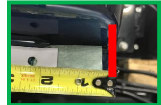
Figure 2. Starting Point of L Dimension

→ Adjust hole locations might be necessary depend on trucks