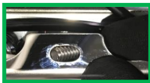
Figure 3. 1/4-20 HHSS Pre-Installation @ 1 st Front(Slot) Hole

→ Adjust hole locations might be necessary depend on trucks