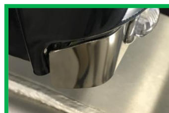
Figure 4. Installed Part - Reference Information